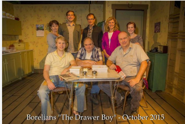
Borelians "The Drawer Boy" - October 2015

Borelians Community Theatre continued to prove that we are a force to reckon with at the annual Association of Community Theatre Central Ontario (ACT-CO) Thea Awards Gala. This year, two Borelians productions were recognized with multiple nominations and several awards.