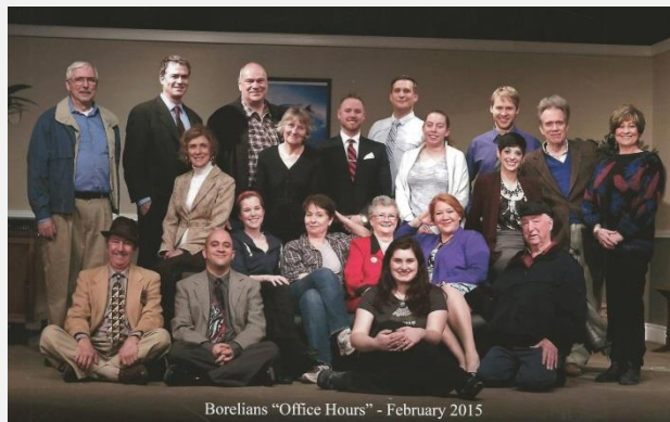
Borelians "Office Hours" - February 2015

Congratulations to everyone involved in both of these award-winning productions, and thank you for your continued support and hard work. This marks the 8 th time in just over thirty years that a Borelians show has won Best Production. It couldn't have been done without the amazing talent and devotion that comes from each of our members.